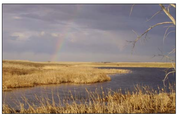
HAPET wetland data are the most extensive and complete record of wetness of prairie pothole wetlands anywhere and provide an excellent benchmark for assessing future changes to wetlands and wildlife in the Prairie Pothole Region.

The HAPET Office is assessing climate change and potential effects of climate change on wetlands and wildlife in the PPR on several fronts. Our efforts are being conducted with a variety of partners, including Region 3 HAPET, the Prairie Pothole Joint Venture, USFWS Division of Migratory Bird Management, USGS Northern Prairie Wildlife Research Center, USGS Fort Collins Science Center, USGS South Dakota Water Sciences Center, USGS Cryospheric Studies Center, and the Plains and Prairie Potholes LCC.