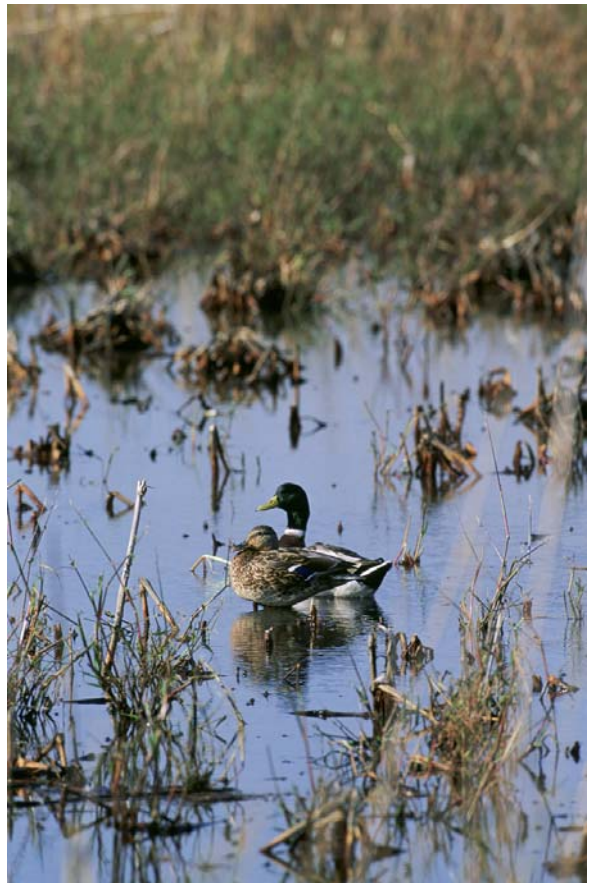
Minor changes in climate can have major impacts on waterfowl-wetland relationships in the Prairie Pothole Region.

Scenario-based simulations suggest that wetlands in the central and western portions of PPR will become drier, with subsequent reductions in waterfowl carrying capacity and brood survival. Publications based on these scenarios suggest that conservation efforts be shifted east, where